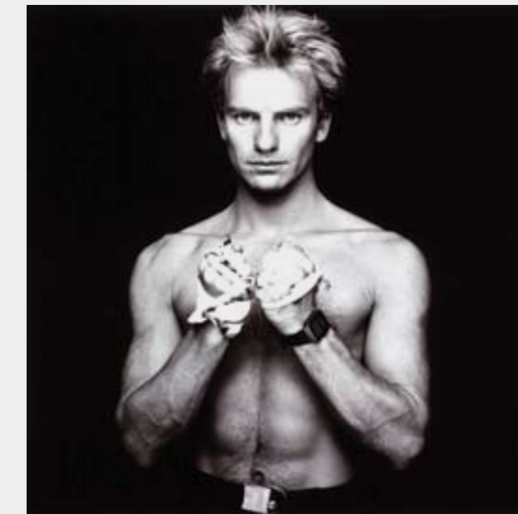
Sting © Terry O'Neill

Alnwick Castle 2 for the price of 1 on entry fee