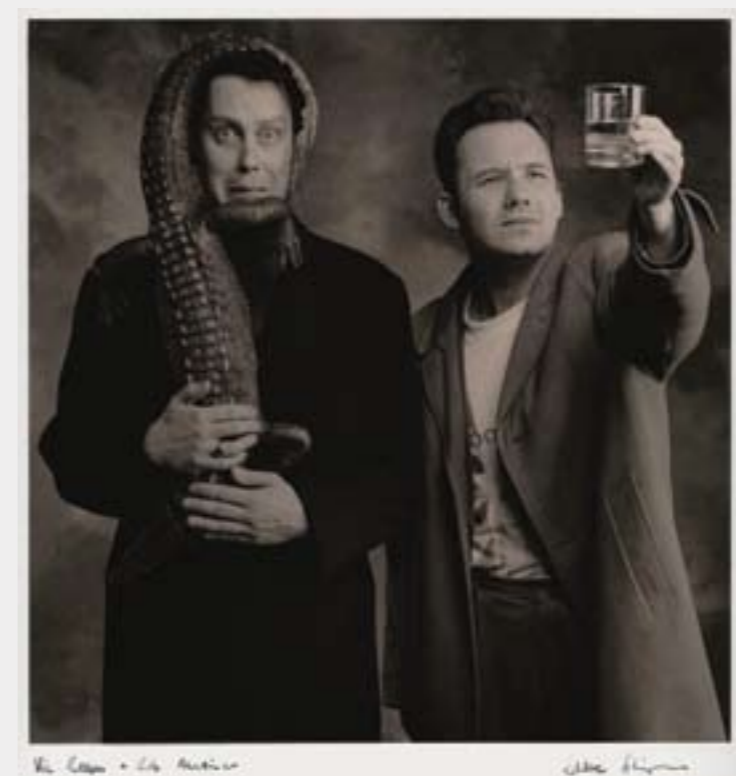
Reeves & Mortimer